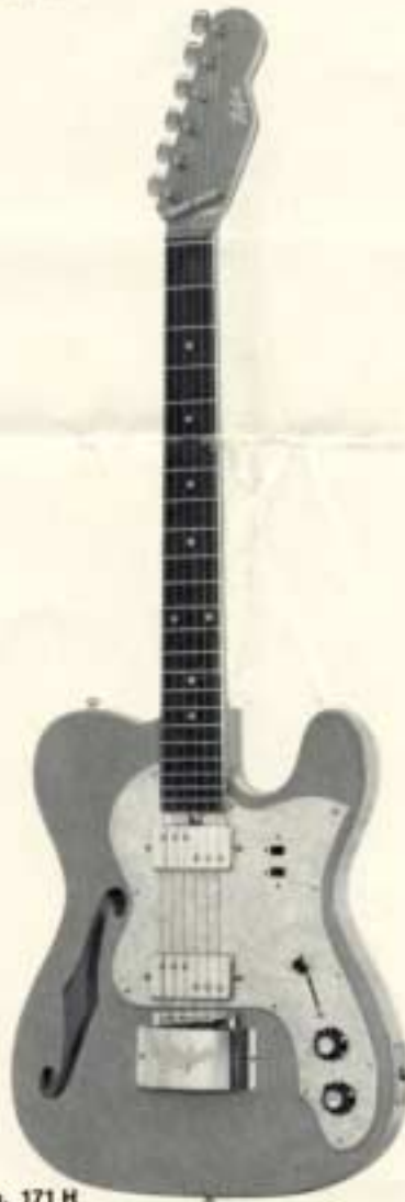
No. 171 H

No. 175 Solid body model, polyester white or sunburst finished. 2 adjustable pick-ups with 6 pole pieces on each pick-up. 3-position pick-up selector switch, 1 tone control, 1 volume control. A famous sound with full basses and brilliant highs.