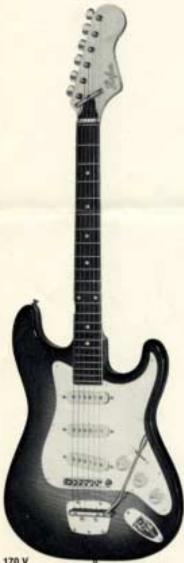
No. 170 V

No. 171 H Semi-solid thinline model, polyester finished in pop colours red, orange, violet, azure blue, dark green, ivory and sunburst. 2 new humbucking pick-ups with wide frequency spectrum and maximum separation of the single strings, 2 tone and 2 volume controls. By means of a 3-position switch for sound selection and 2 sliding switches both pick-ups can be combined. By series connection, phase inverter connection and both connections together numerous new tone variations can be reached.